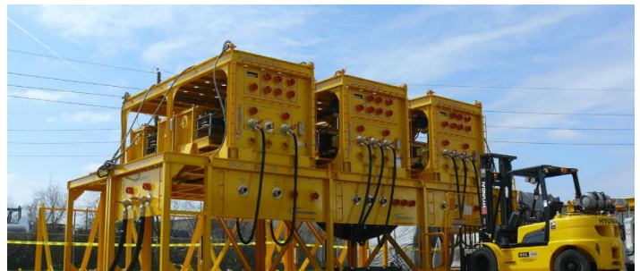
Figure 2 SDFS Battery/Pumping Skids

OceanWorks International is a subsea solution engineering company, providing more than 20 years of service to the Oil & Gas, Military, Scientific, and Environmental markets. The SDFS project involved design, engineering, analysis, manufacturing, testing, documentation, and a close working relationship with all of the stakeholders. For more information regarding OceanWorks International's products and services visit our website, www.oceanworks.com , or contact us at sales@oceanworks.com