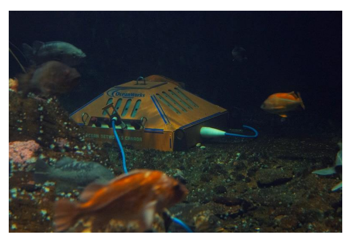
A representation of the OceanWorks Seafloor Node at rest in the Strait of Georgia Aquarium tank

OceanWorks International Inc. 11611 Tanner Rd. Suite A Houston, TX USA, 77041 Tel: +1 281 598 3940 Fax: +1 281 598 3948