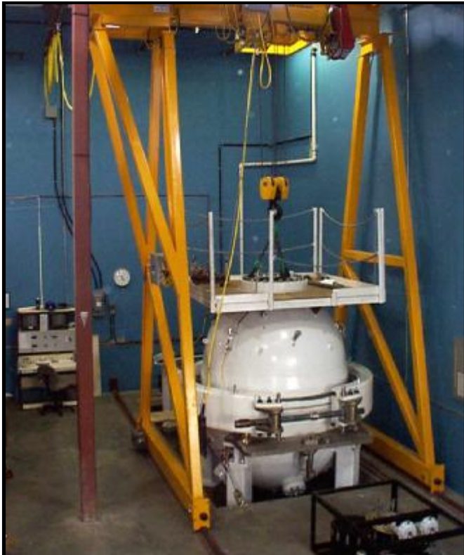
4500 fsw Test Pot and 10t Crane