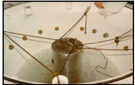
ELSS Pod ↓