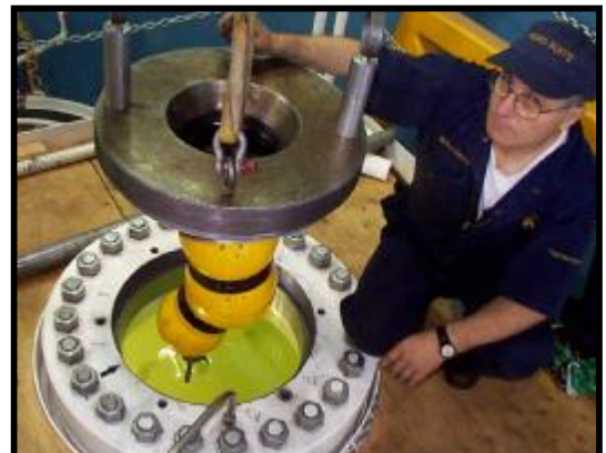
Top Flange Insert

OceanWorks International Corporation 3 – 1225 East Keith Road North Vancouver, BC Canada V7J 1J3 Tel: 1+604-986-5600 Fax: 1+604-986-7125