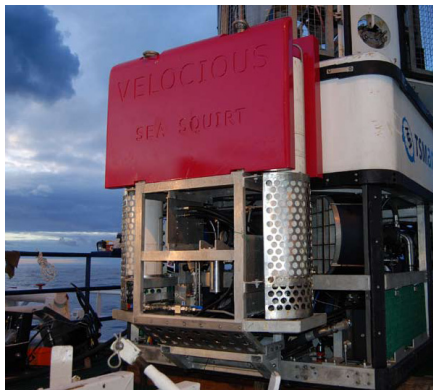
Velocious' Fluid Injection System "Sea Squirt"

Velocious continues to expand its range of local services whilst simultaneously expanding its network of international alliance partners rich in complimentary skills.