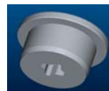
CLASS 1 & 2 1 1/2" square