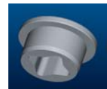
CLASS 4 1 1/16" square

HOUSTON, TEXAS, USA: OceanWorks International, Inc. 11611 Tanner Rd. Suite A Houston TX 77041 USA +1 281 598 3940 Tel. +1 281 598 3948 Fax