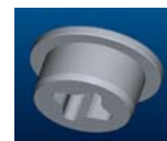
CLASS 3 1 1/8" square